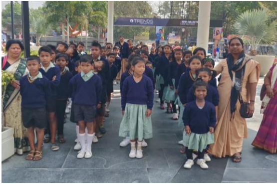
Literacy students' day out.