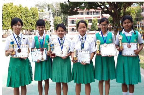
Inter School Badminton winners, St. Joseph's High School, Matigara