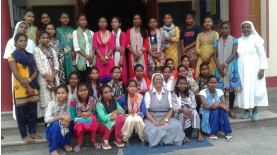
Vocation camp in pastoral centre, Matigara. organized by the local CRI.