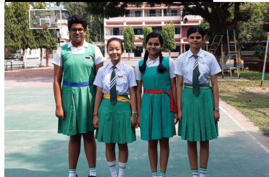
CBCI national quiz competition winners (state level - second prize)