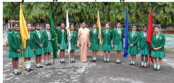
Investiture ceremony 2019