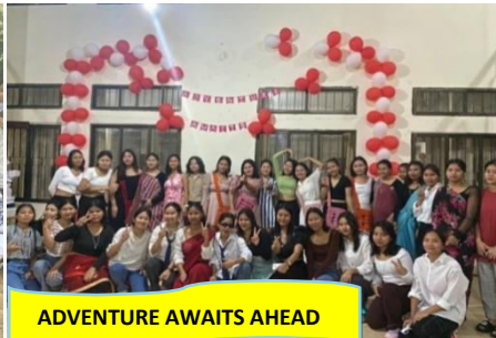
ADVENTURE AWAITS AHEAD