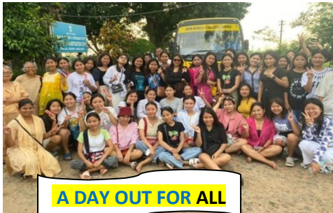
A DAY OUT FOR ALL

Third year Degree students had tearful farewell from College and from the hostel. They are leading for another mile stone of life.