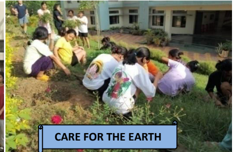
CARE FOR THE EARTH